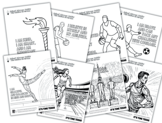
40 Affirmation Coloring Pages