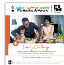
10 Weeks of Social Media Content

Register at itstimetexas.org/ssh to receive materials